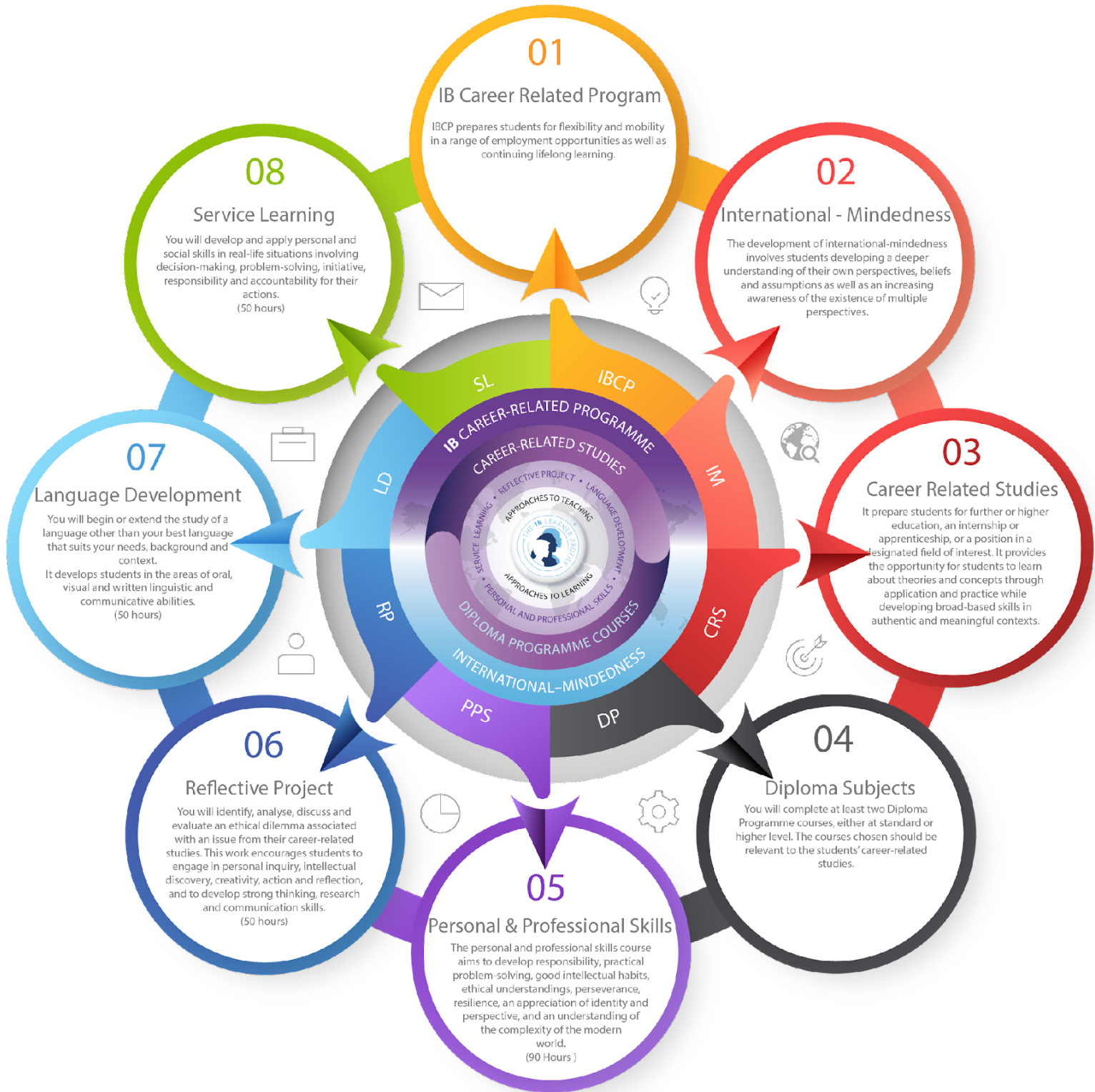
Model of the Career-related Programme